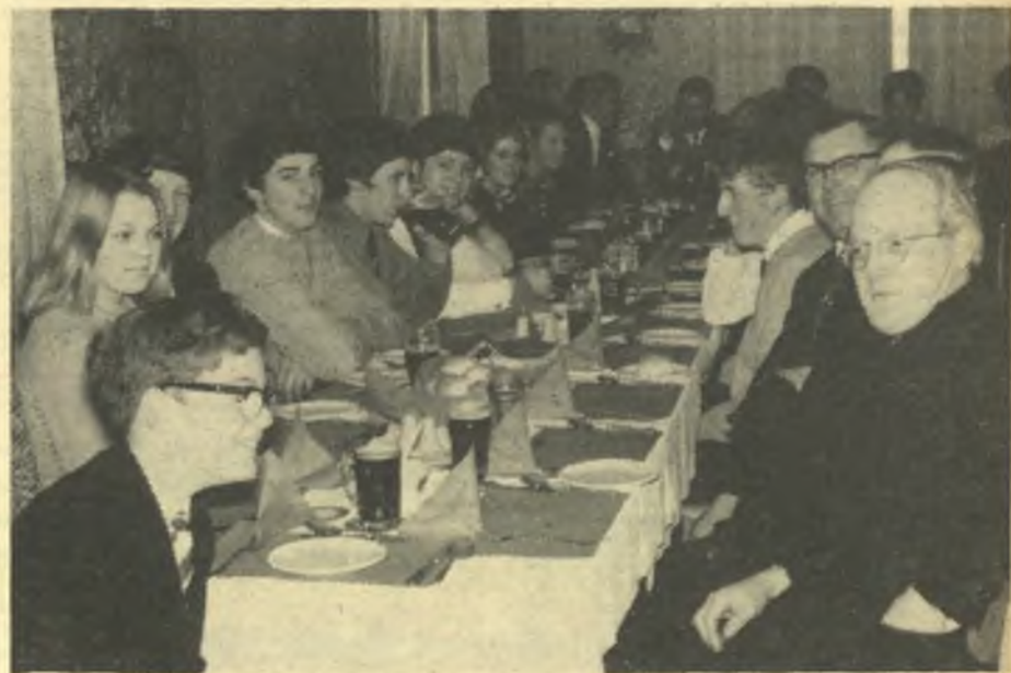
The ringers and choir of Waltham, Grimsby, photographed at the dinner, which they pay for themselves by fund-raising efforts (R.W., page 240).

The secretary of St. Mary-at-Finchley, London, tells of incidents which occur during weekly practices: On practice night (March 12) jelly paint stripper was generously daubed all over the cars of three of the practising ringers, and sugar put in the petrol tank of one of them. This is not the first incident of this nature. Last year black paint was applied to the ringers' cars. No complaints have been made to any of the ringers about the bells, but at least one of the ringers has a great desire to ring a muffled peal for the person responsible!