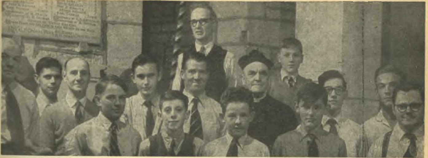
This photo, salvaged from the fire, was taken some 17 years ago and depicts the Archdeacon with his ringers.