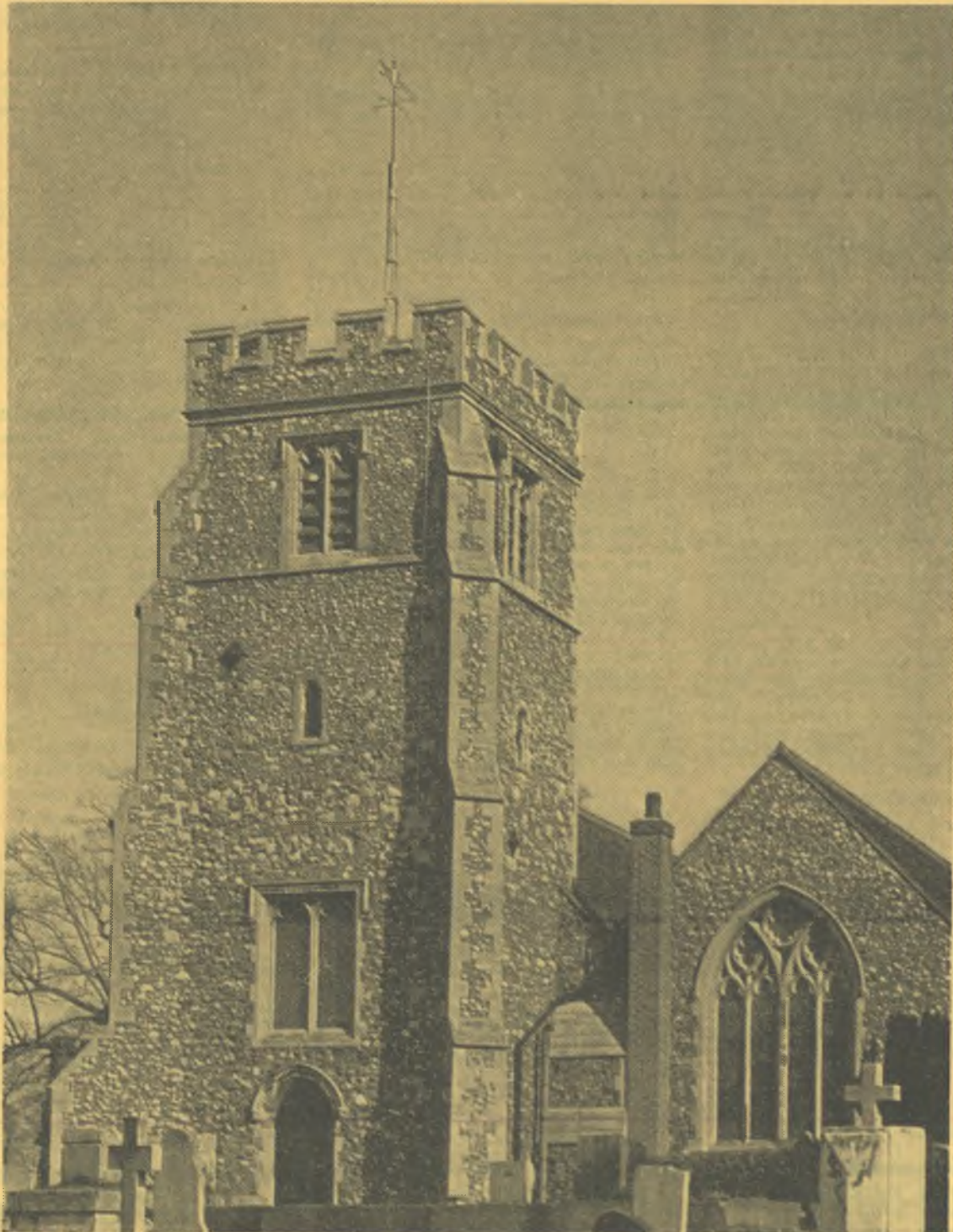
The Church of SS. James and Paul, Bushey, Herts.