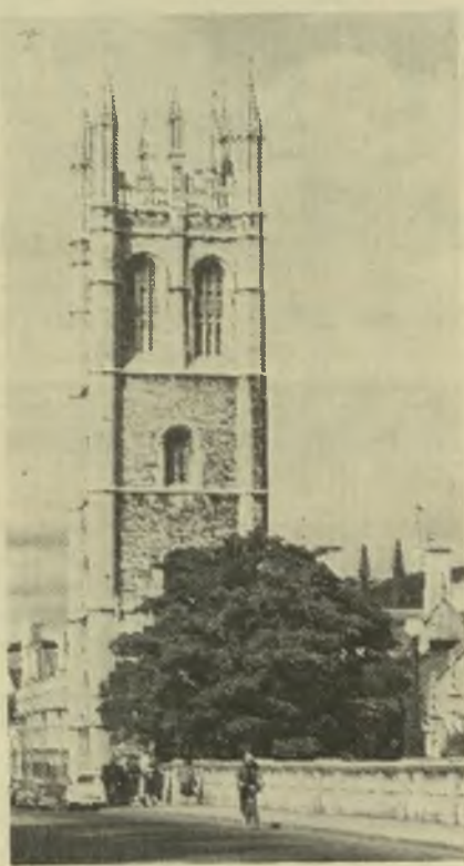
MAGDALEN COLLEGE TOWER Exquisite Proportions.

considered everything he thought should be done.