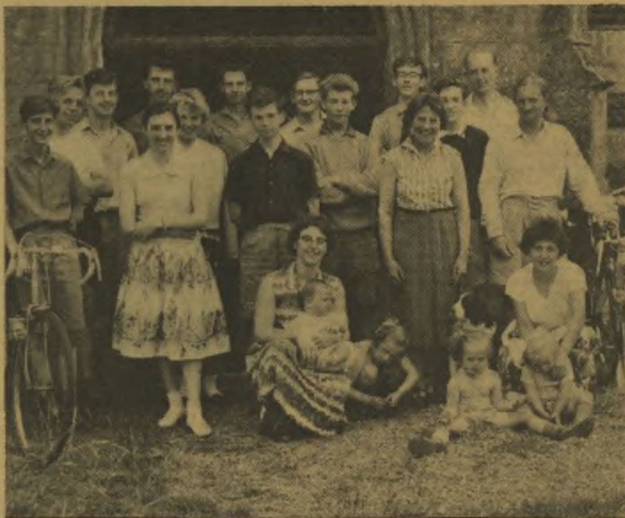
THE EAST RIDING RINGERS OUTSIDE TATTERSHALL CHURCH.

Thursday was the turning point on the tour, when the A.I. took us part of the way to Deeping St. James (6) and Market Deeping (6). Two local ringers joined the band at Bourne (6). Thurlby (5) and Edenham (8) were on the route back to Grantham for the third night there.