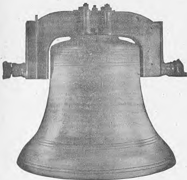
SHERBORNE ABBEY RECAST TENOR.