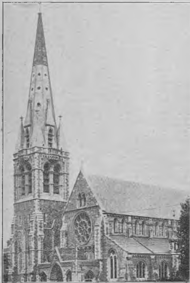
THE CATHEDRAL AT CHRISTCHURCH, NEW ZEALAND.