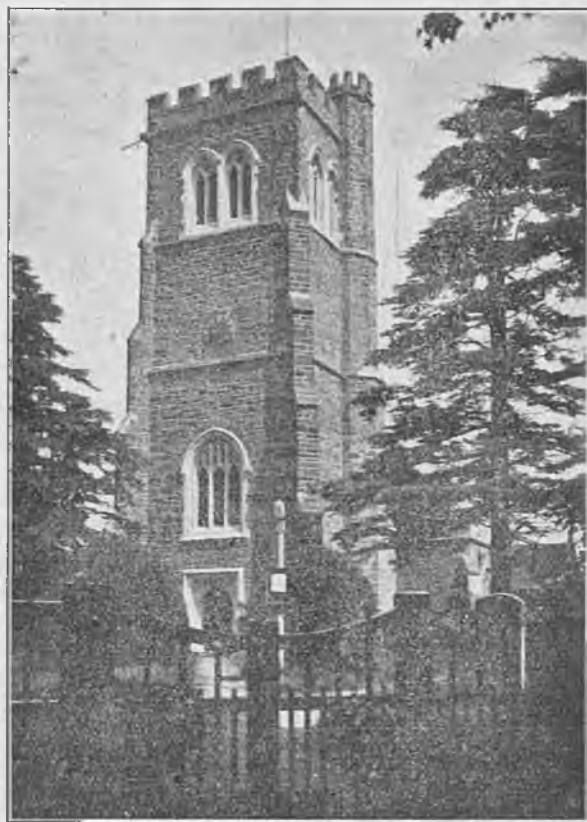
THE TOWER OF HUSBORNE CRAWLEY CHURCH.

The old six are a mixed lot, as will be seen from the following details of the ring:—