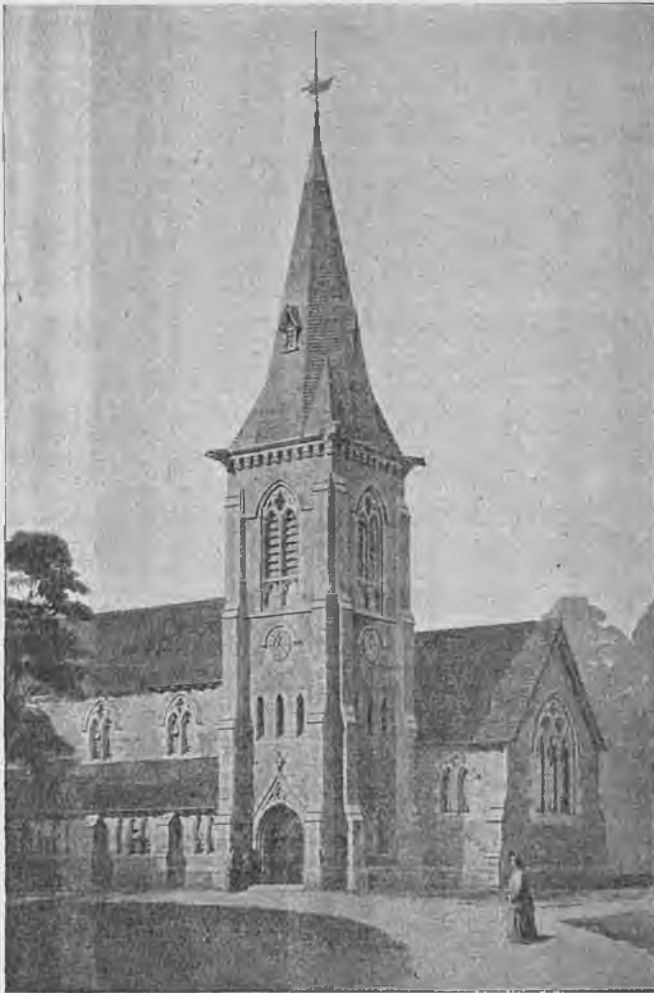
ST. LUKE'S CHURCH, GRAYSHOTT.