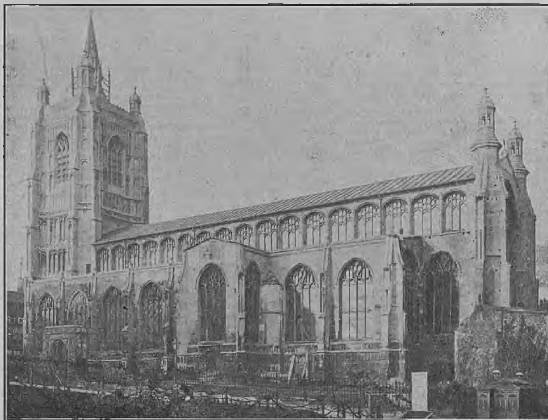
THE CHURCH OF ST. PETER MANCROFT, NORWICH.