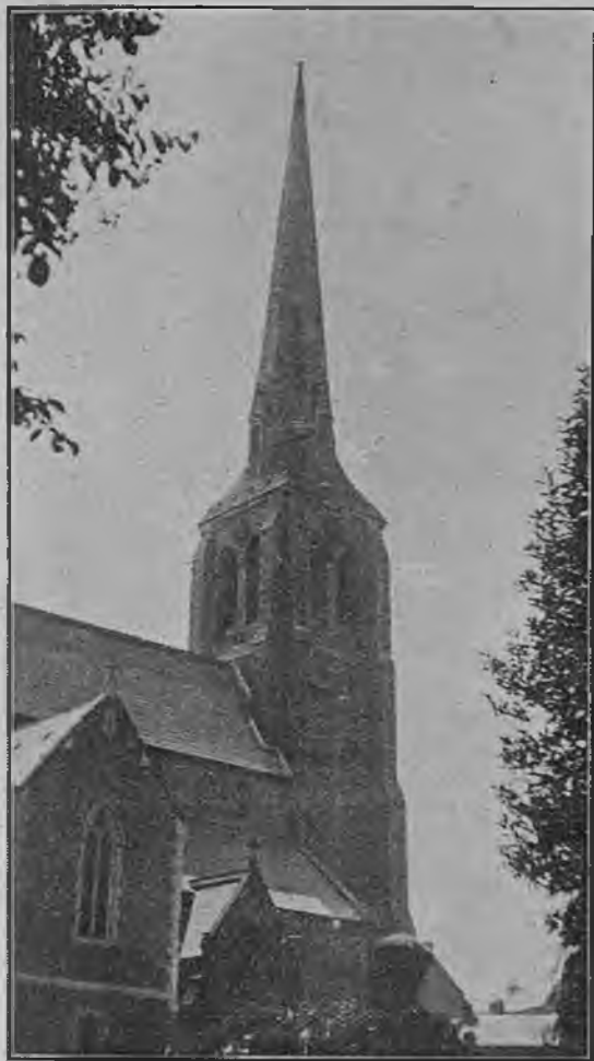
The tower of the Church of the Immaculate Conception, Wexford, where the new ring of ten bells has been opened.

It was evident that the bells had not been rung for many years owing to these conditions, and as a result of the long inaction the fittings had become dilapidated and dangerous. Eventually it was decided to recast all the bells into a ring of ten, and hang them with