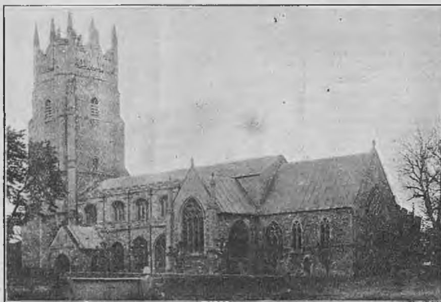
St. Andrew's Church, Soham, Cambs, where the Cambridge University Guild rang one of their peals during their 'Jubilee' week.

In reply, the President thanked the Guild for its unexpected gift, and expressed his pleasure at entertaining so many of the Guild's members.