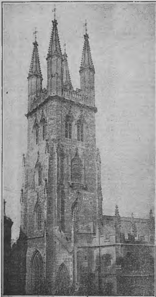
ST. SEPULCHRE'S CHURCH, SNOW HILL.

The anniversary of the first peal of Treble Bob Royal, which occurs next week, makes interesting two of the peal boards hung in the steeple of St. Sepulchre's Church, Snow Hill, London, where the Eastern Scholars achieved this first performance.