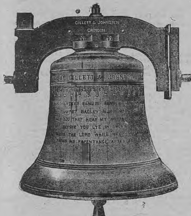
St. Peter's Collegiate Church, Wolverhampton. Tenor (33 cwt.) of the New Ring of 12

WULFRUN CHAMBERS, WOLVERHAMPTON, MESSRS. GILLETT and JOHNSTON, CROYDON, 4th March, 1912 Gentlemen,