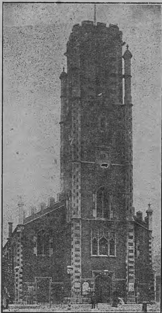
BISHOP RYDER'S CHURCH, BIRMINGHAM.