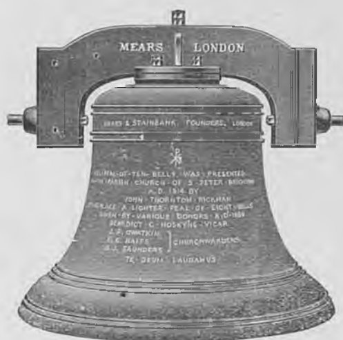
Tenor Bell, 25½ cwt., of the new ring of Ten at St. Peter's, Brighton.