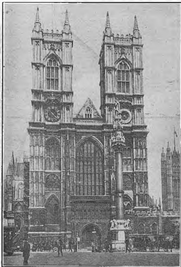
WESTMINSTER ABBEY WEST FRONT.

'King Edward made me thirtie thousand weight and three, Take mee down and way mee and more yu shall fynd me.'