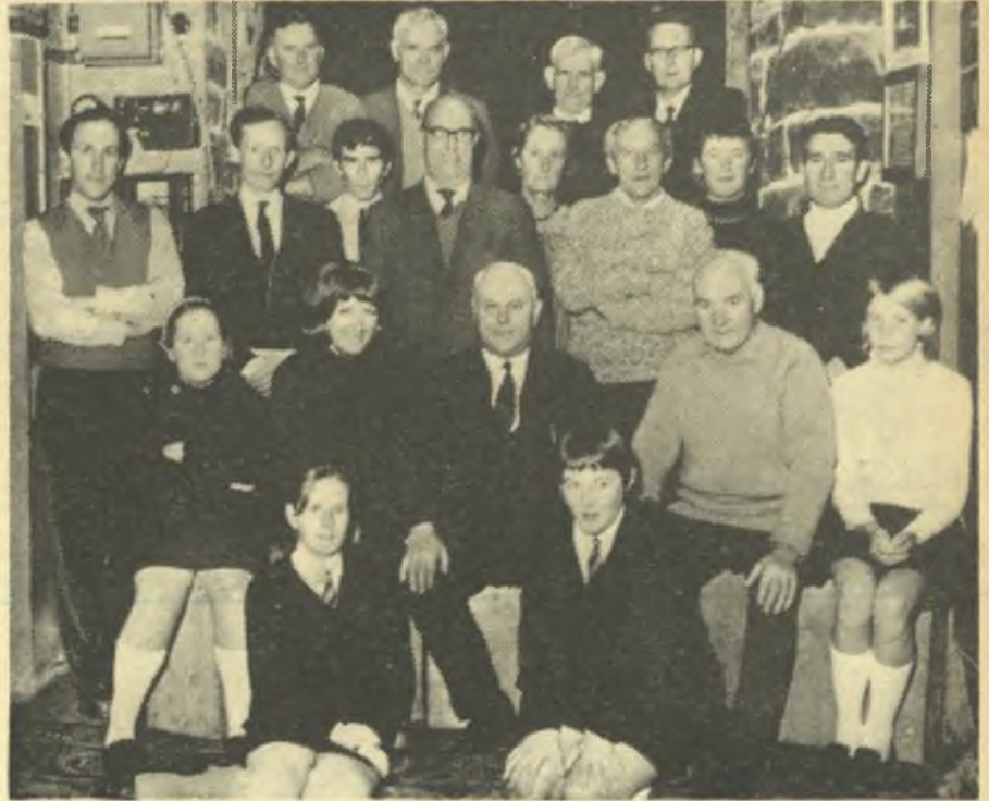
Details supplied by Stratton ringers.

Visitors are always welcome for ringing on Sundays, 9.30 to 10.30 a.m., 5 to 6 p.m.; practice every Thursday, 7 p.m. to 8.30 p.m. First Monday in the month, Stratton, 7 p.m.; second Monday in the month, Marham Church, 7 p.m.; third Wednesday in month, Bridgerule, 7 p.m.