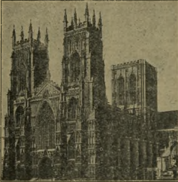
YORK MINSTER. Perpendicular Gothic.

There are 45 cathedrals in England and Wales. Of these twenty-one are of the 'Old Foundation,' that is, consecrated at various times before the Reformation; six are 'New Foundation' monastic churches, constituted cathedrals by Henry VIII.; a further five are monastic churches which became cathedrals in modern times to meet the needs of increased population; one is modern, and ten are parish churches which have been made the cathedrals of new modern dioceses. Two new cathedrals, Liverpool and Guildford, are still in building. All are Norman or Gothic, with but two exceptions, and they constitute a truly amazing series of religious monuments unsurpassed anywhere in the world. With the exception of recent Foundations, they have all been very extensively described and illustrated, and are well known, at least superficially, to a large percentage of English people. I can go no further here than to mention a few typical examples which illustrate the best of each period. I wish I could give some photographs, but for technical and supply reasons connected with paper this is impossible.