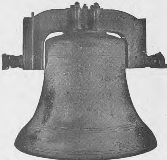
SHERBORNE ABBEY RECAST TENOR. 46 cwt. 0 qr. 5 lb.