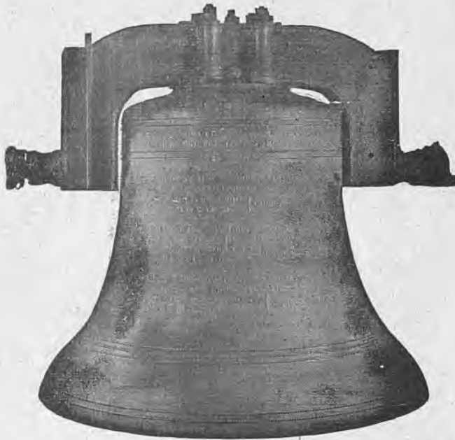
SHERBORNE ABBEY RECAST TENOR. 46 cwt. 0 qr. 5 lb.