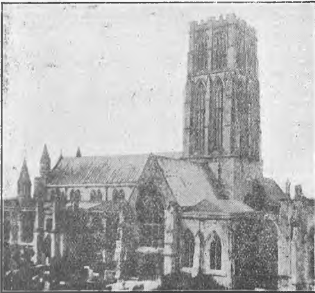
HOWDEN PARISH CHURCH.

All Saints' Church, Pontefract, was selected as the place for the next meeting in June