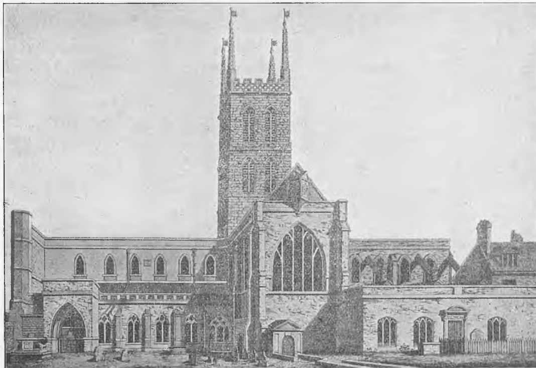
THE CHURCH OF ST. SAVIOUR, SOUTHWARK, IN THE 18th CENTURY.

In the early days of the fifteenth century there were seven bells in the tower, which are said to have been re-