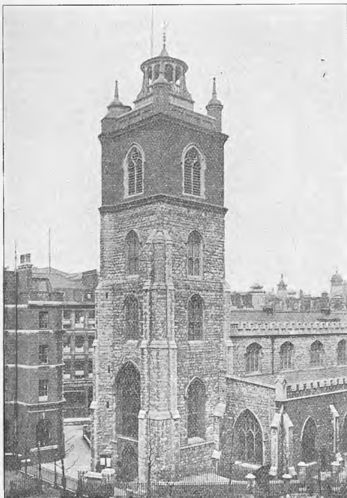
ST. GILES', CRIPPLEGATE.

Saint Giles', Cripplegate, is one of the finest and most interesting of the London churches. Built in 1545 to replace an older building, it just escaped the fire of 1666, and, as narrowly, a great conflagration which destroyed Jewin Crescent in the opening years of the present century. The style—Perpendicular Gothic—is in marked contrast to that of the majority of the city churches and gives a good idea of what most of the larger ones were like before they were rebuilt by Sir Christopher Wren. The church is closely associated with several great