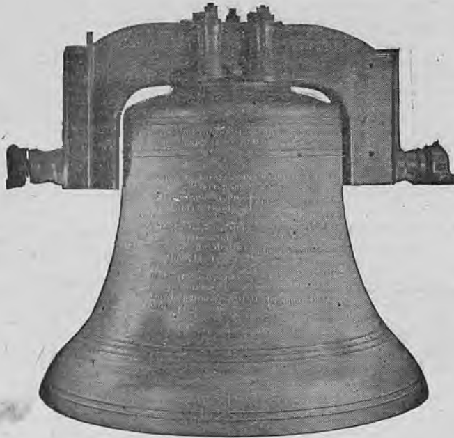
SHERBORNE ABBEY RECAST TENOR. 48 cwt. 0 qr. 5 lb.