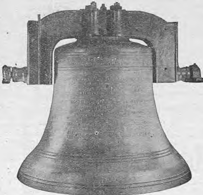
SHERBORNE ABBEY RECAST TENOR. 48 swt. 0 qr. 5 lb.