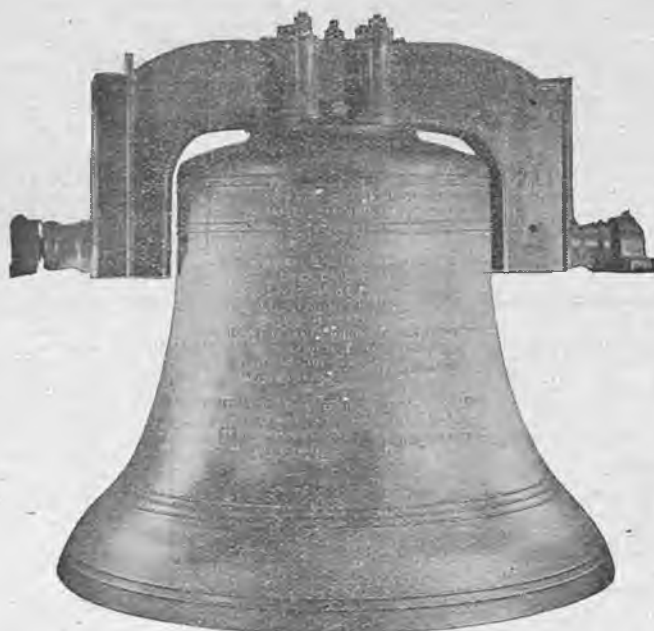
SHERBORNE ABBEY RECAST TENOR. 45 cwt. 9 qr. 5 lb.

ESTIMATES SUBMITTED for Recasting, Retuning and Rehanging