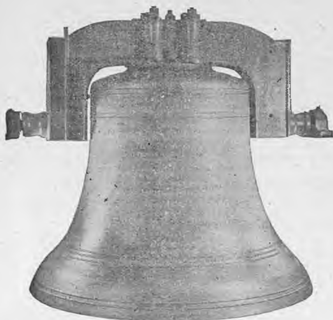
SHERBORNE ABBEY RECAST TENOR. 48 cwt. 0 qr. 5 lb.