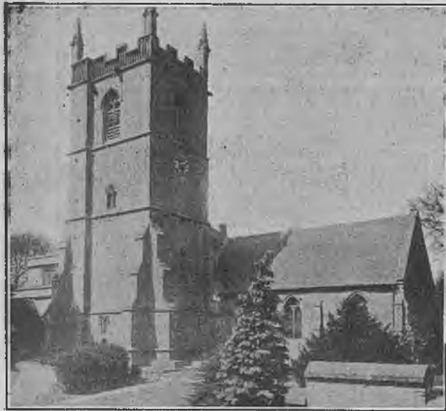
THE PARISH CHURCH OF STOW-ON-THE-WOLD.

Stow-on-the-Wold, where a peal of Bob Major was rung on November 26th, is a small but old-fashioned North Cotswold town, situated on a hill which is 800 feet above sea level, and when in winter time a "Nor' Easter" is blowing the old-time rhyme certainly comes true, viz., "Stow-on-the-Wold, where the wind blows cold." The church stands nearly in the centre of the town, and the tower is a landmark for miles around.