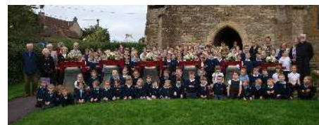
Templecombe bells at their blessing service

At the time of writing this report work at Bath Christ Church, Great Malvern, Kelham, Meldreth, North Creake, Templecombe and Tollesbury has been completed.