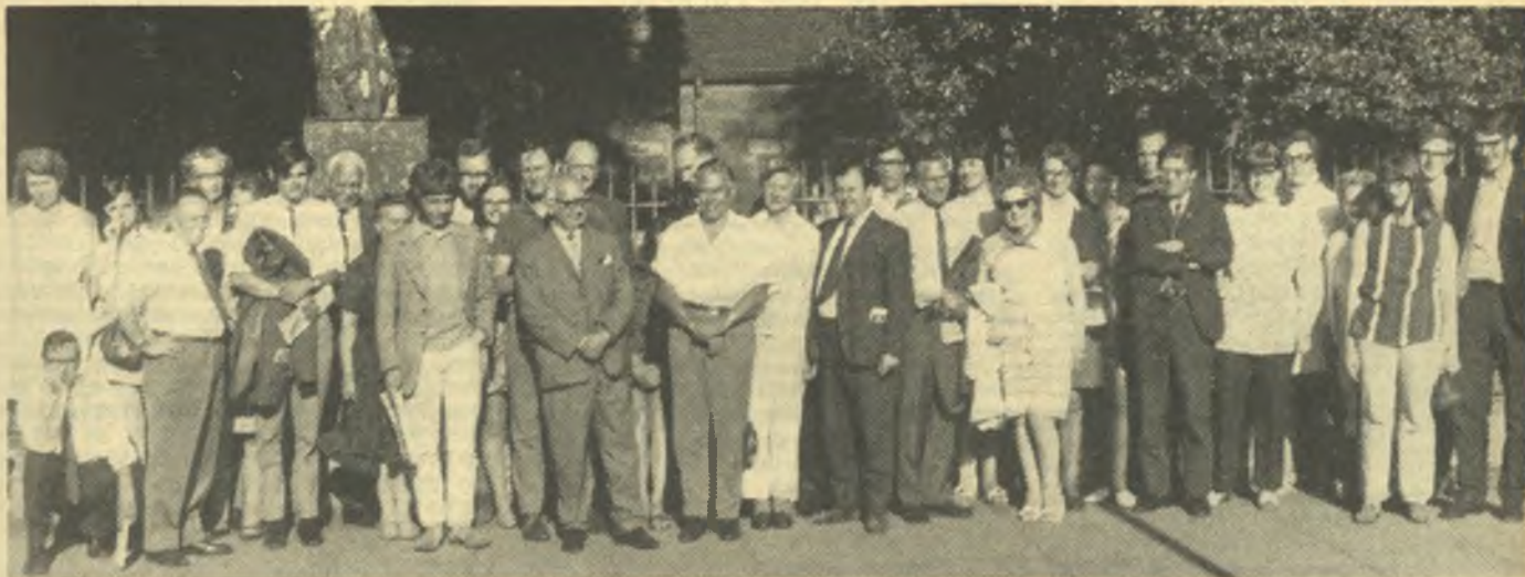
London County Association.

Early in July the members of the London County Association left South Kensington for Rutland and Northamptonshire. The day started off rainy but by the time coffee was taken at Stamford the weather had improved and it remained hot and sunny.