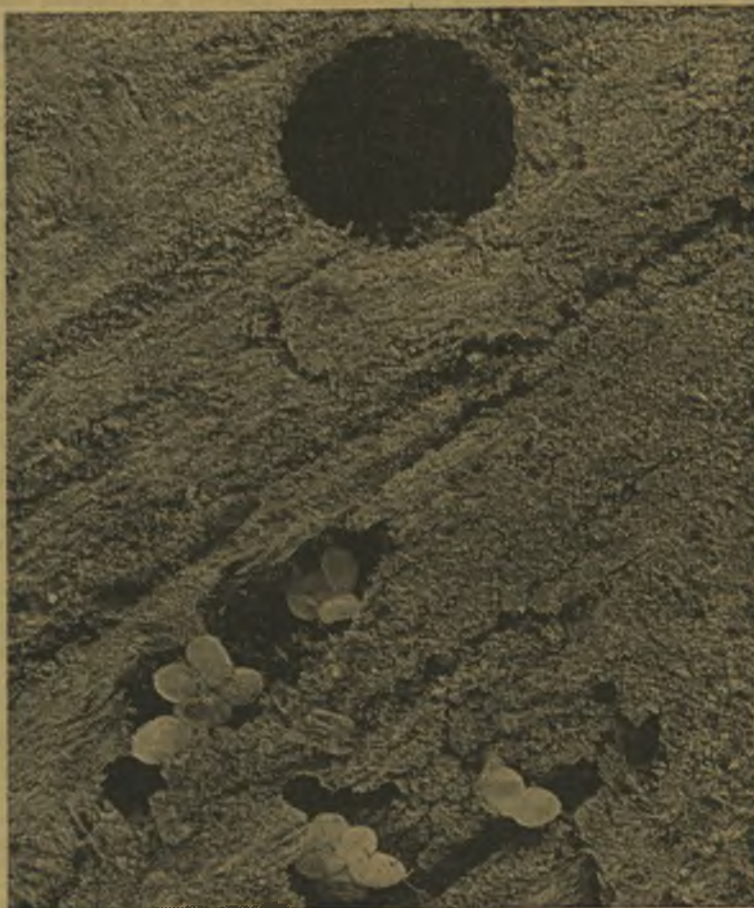
Clutches of eggs laid by the female of Xestobium rufovillosum , the Death Watch Beetle. At the top of the picture is an old beetle flight hole \frac{1}{8} inch in diameter—a perfect circle.

These, then, are the signs to look and listen for—the tapping sound, dead beetles, flight holes and the little heaps of bun-shaped pellets.