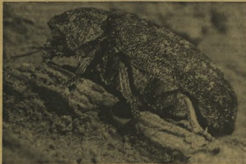
Xestobium rufovillosum , the Death Watch Beetle. The fine yellow hairs from which it gets its name give it a variegated appearance. This adult beetle is only 6 mm. long.

Briefly the life cycle of the death watch beetle is as follows. The females lay their eggs usually between 40–60 in numbers, either singly or in pairs, in cracks or crevices in the wood or in old exit holes, anywhere in fact where there is safe and firm anchorage. The eggs hatch out after about 3½ weeks, but they are so small you are unlikely to see them. When the tiny grub emerges it fairly soon burrows into the wood, where it may continue quietly tunnelling and growing for up to ten years. It then comes up to the surface and, just underneath, forms a pupal chamber, where it turns into a beetle. This, strangely enough, takes place in autumn and there it remains as an almost perfectly-formed beetle till it emerges in the spring.