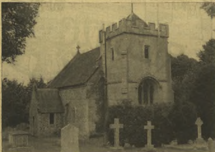
ST. GEORGE'S, ORCHESTON

Berwick St. James (4). —In terrible condition. Broken wheels, clappers missing. Really a five, with the 4th represented only by a headstock.