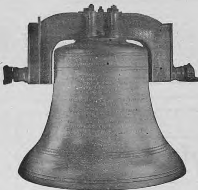
SHERBORNE ABBEY RECAST TENOR. 46 cwt. 8 qr. 5 lb.