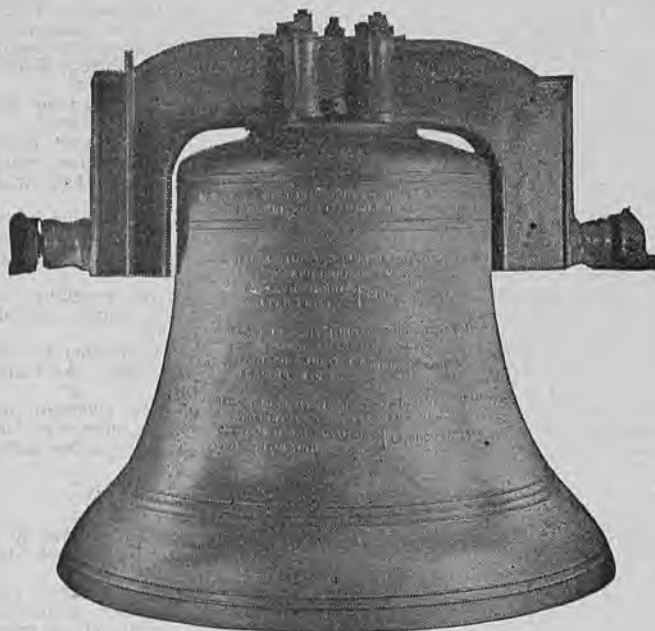
SHERBORNE ABBEY RECAST TENOR.