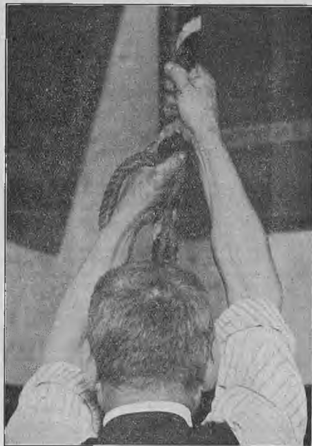
This photograph shows the proper way to hold the rope end and sally at handstroke.

The first aim of a beginner should be to hold his rope properly. Both at rope-end (that is, backstroke) and sally (the handstroke), the hands should be raised as high above the head as possible. It gives the best control, and, of course, the longest and, therefore, the most effective pull. Many ringers at handstroke grasp the sally at a spot which does not permit their hands going much above their nose, or even their chin, and their hands go up very little higher at backstroke.