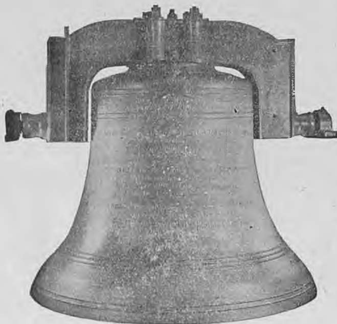
SHERBORNE ABBEY RECAST TENOR.