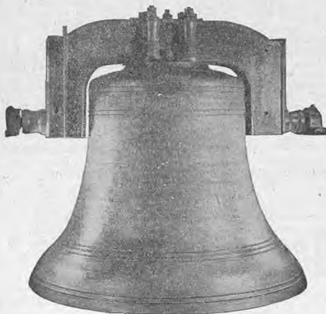
SHERBORNE ABBEY RECAST TENOR. 48 swt. 0 qr. 5 lb.