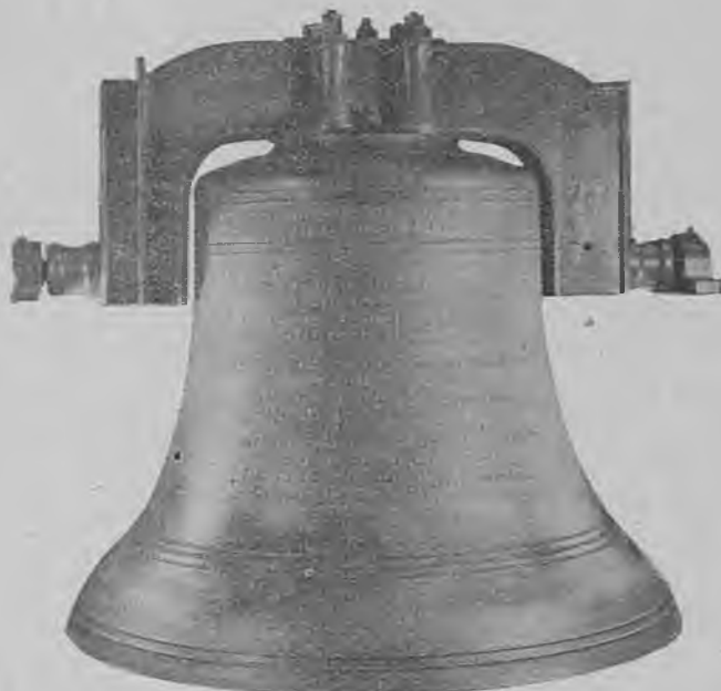
SHERBORNE ABBEY RECAST TENOR. 46 cwt. 0 qr. 5 lb.