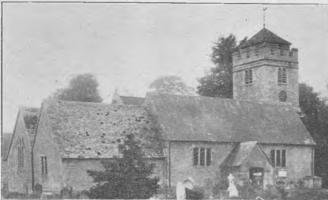
ST. LAWRENCE'S CHURCH, APPLETON.