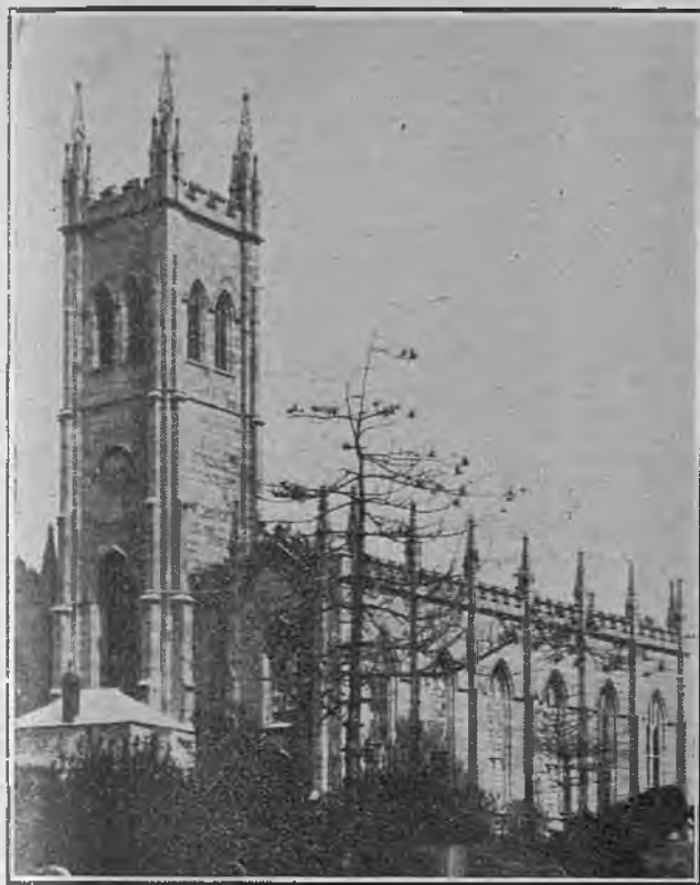
ST. MARY'S CHURCH, PENZANCE.