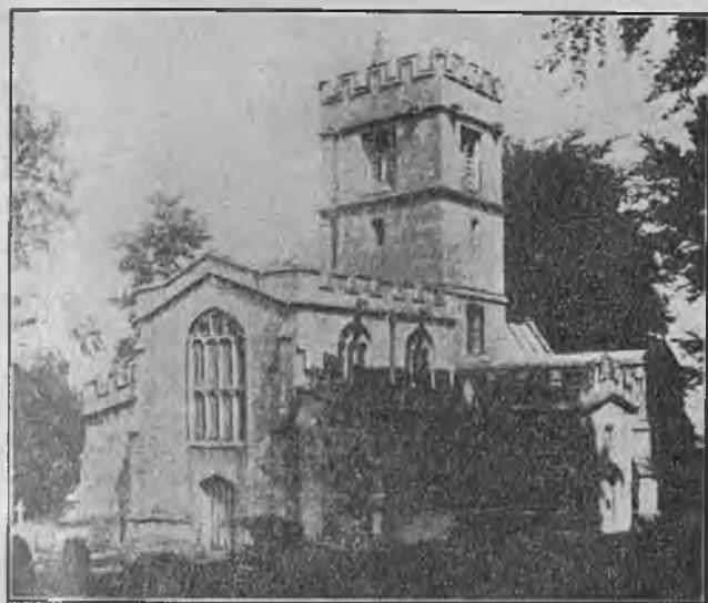
The Interesting Church at Bratton, Wilts.