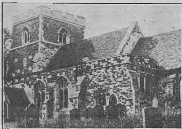
TILSWORTH CHURCH, BEDS, where the bells have just been recast and augmented to six.