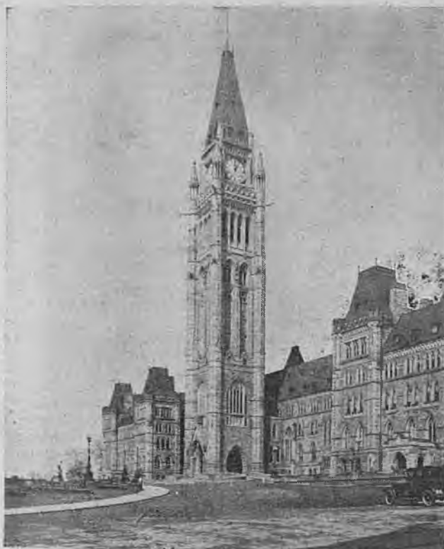
THE VICTORY TOWER Height 300 feet