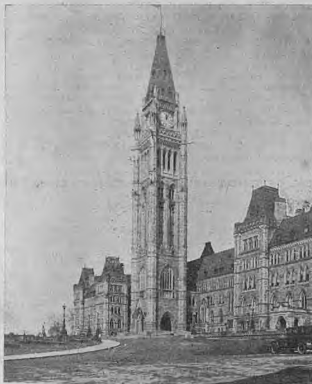
THE VICTORY TOWER Height 300 feet