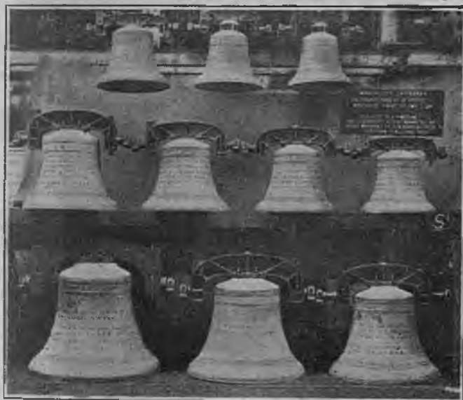
The Recast Ring of 10 (Tenor 28 cwt.) for MANCHESTER CATHEDRAL, Nov., 1925