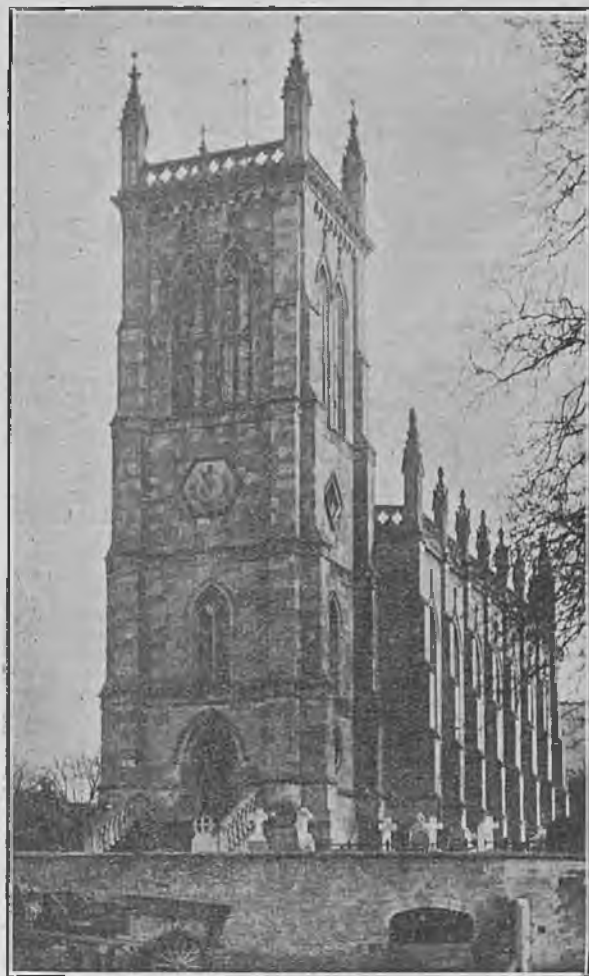
KING'S NORTON CHURCH, LEICESTERSHIRE.

The Church of St. John the Baptist, Norton-by-Galby, Leicestershire (otherwise known as King's Norton) possesses a fine peal of eight bells, bearing the following inscriptions:—