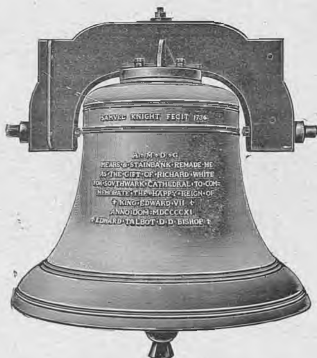
THE TENOR BELL, SOUTHWARK CATHEDRAL. Weight, 50 cwt, 0 qr. 21 lbs.

Bellfounders & Bellhangers, 32 & 34, Whitechapel Road, LONDON, E.