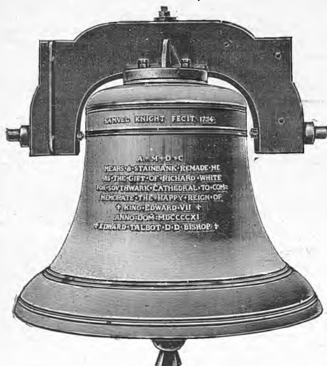
THE TENOR BELL, SOUTHWARK CATHEDRAL. Weight, 50 cwt. 0 qr. 21 lbs.

Bellfounders & Bellhangers, 32 & 34, Whitechapel Road, LONDON, E.