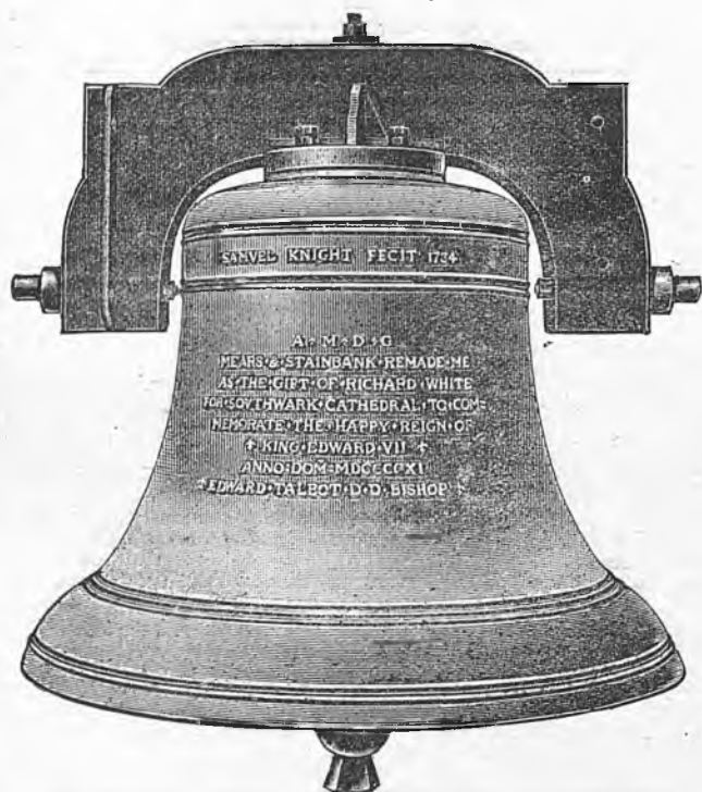
THE TENOR BELL, SOUTHWARK CATHEDRAL, Weight, 50 cwt, 0 qr. 21 lbs.

Bellfounders & Bellhangers, 32 & 34, Whitechapel Road, LONDON, E.