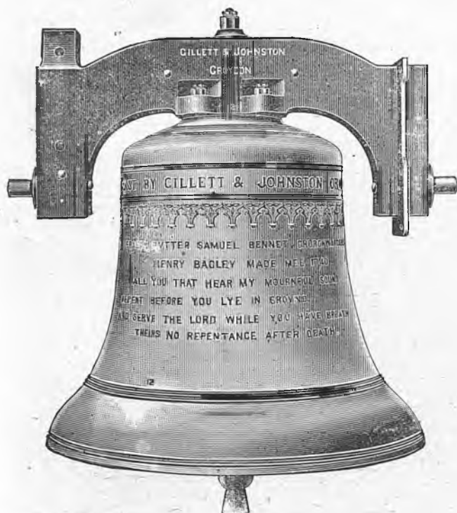
St. Peter's Collegiate Church, Wolverhampton. Tenor (33 cwt.) of the New Ring of 12.

WULFRUN CHAMBERS, WOLVERHAMPTON, MESSRS. GILLET and JOHNSTON, CROYDON, 4th March, 1912. Gentlemen,